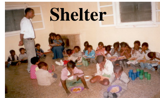
children at New Hope Center thank God for their beans and Ingera.