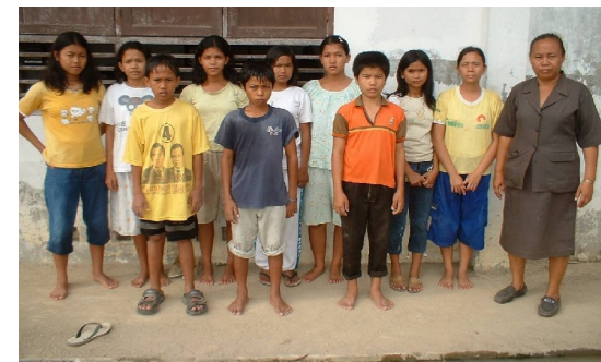
Some of our children at the new home we sponsor in Medan, Indonesia, with their school principal.